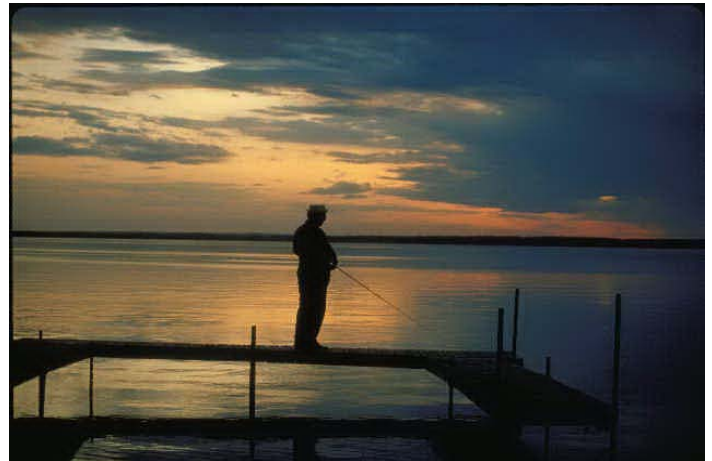
"Evening Fishing" from PrintMaster