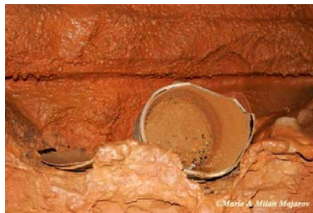
Grand Caverns water crock.