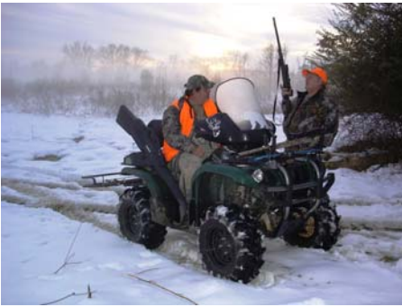
Hunting buddies confer on plans for the next day's hunt as "snow fog" settles in at dusk. December 2009, Friends and Family Hunt Club, Louisa, Va.