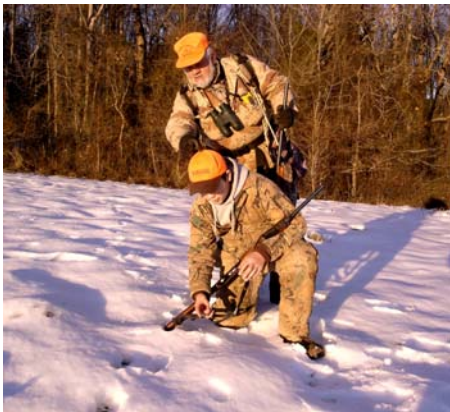
Mentoring young hunters is important to passing on the traditions of sportsmanship and self reliance. The record December snowfall provided a rare opportunity to observe tracks in the snow to learn the travel patterns and feeding habits of wildlife under winter conditions.

and has been retired for several years from Forest Service law enforcement. We've both had a few health issues and our conversation turned to comparing injuries and operations. We concluded that we need to take more time out of doors and to think about the things that really matter. Although there are trials and tribulations, and the news is full of woe about the bad economy, we have truly been blessed to live at a great time in a great land – and we can have new parts put in when the old ones wear out. Here's hoping all your parts work well, and that you take the time to get outside and consider what it really important.