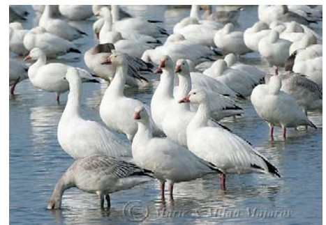
Snow geese at Chincoteague National Wildlife Refuge on the Eastern Shore.